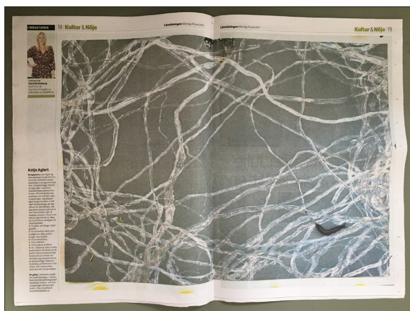
Figure 3: Turning Over the Grounds of sgulS , art work printed in a newspaper as part of Konstfrämjandet + LT. Photo: Katja Aglert. Reproduced with permission of the artist.

I present a video clip documenting the performance "Turning Over the Grounds of sgulS" (Aglert. 2017) and walk over to the table with the objects, where I pick up a newspaper, open it, and show to the audience a full-page photograph documenting the same performance ( Figure 3 ), and say: