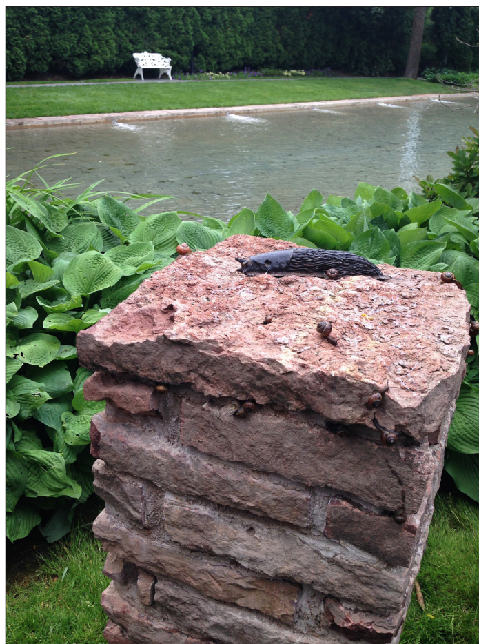
Figure 2: Liminal Creature , bronze sculpture of a Spanish slug in the outdoor park Marabouparken. Photo: Katja Aglert. Reproduced with permission of the artist.

"Liminal Creature" from 2014 is a sculpture in bronze and sandstone ( Figure 2 ). The sculpture is a portrait of the Spanish slug, installed in the outdoor park Marabouparken as part of the permanent historical sculpture collection of the park. I let the slug enter into dialogue with the park's existing sculptures.